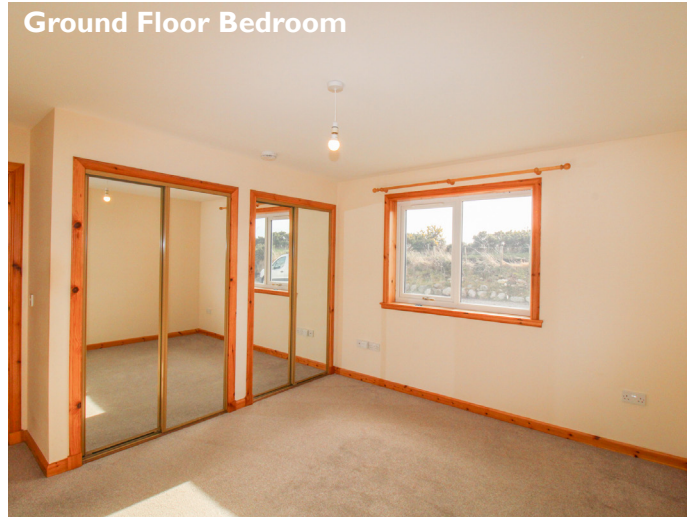
Ground Floor Bedroom